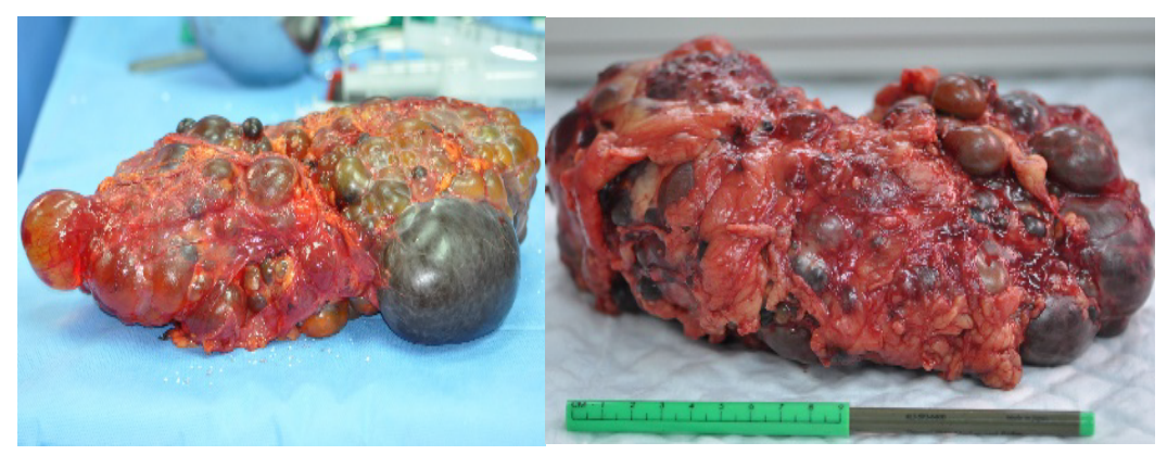
Left kidney 31x18cm. Weight 2.68 Kg Right kidney 21x14 cm. Weight 1.29 kg